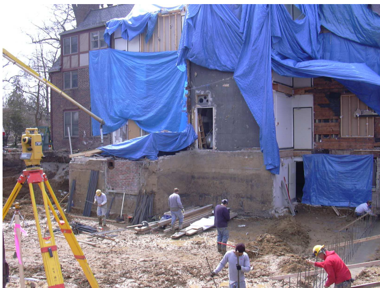
April 6 – Primary 'demo' zone on the day the footings were poured

Last but not least, we held two special evangelistic services in March and we had a fantastic turnout. On one weekend, we counted 900 people! God is clearly working here in Ann Arbor!